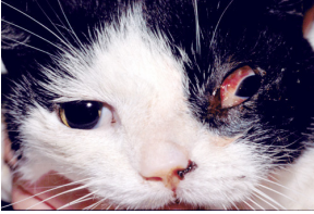
Figure 3. Strabismus. Strabismus and ventrolateral displacement of the left globe is present in this 3-year-old male cat. The pars orbitalis of the frontal bone was fractured as a result of automobile trauma.