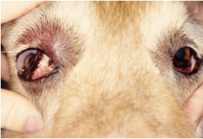
Figure 4. Clinical signs of an abscess of the right orbit. Substantial chemosis, conjunctival hyperemia, exophthalmos, blepharedema, and elevation of the third eyelid are evident in this Golden Retriever with an orbital abscess. The abscess was attributable to a root abscess of the maxillary 4 th molar tooth.