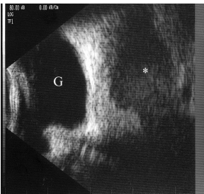
Figure 5. Ultrasound image of an orbital abscess in a dog. Note the hypoechoic abscess cavity (asterisk) surrounded by a well-defined slightly more hyperechoic border. The globe (G) is located at the left of the image.