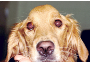
Figure 7. Bilateral enophthalmos is present in this 7-year-old spayed female Golden Retriever with chronic masticatory myositis. Note the severe atrophy of the masseter and temporalis muscles resulting in a prominent zygomatic arch. Mild entropion of both upper eyelids and trichiasis of the upper eyelashes secondary to enophthalmos is present.