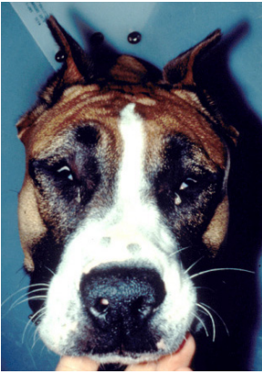
Figure 2. Enophthalmos. Bilateral enophthalmos is present in this Boxer dog with tetanus. Both third eyelids are protruding excessively in response to retraction of the globes.