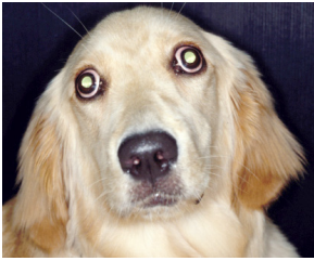
Figure 8. Bilateral exophthalmos, upper eyelid retraction, 360-degree scleral show, and absence of protrusion of the third eyelid are evident in this 7-month-old female Golden Retriever with bilateral extraocular polymyositis.