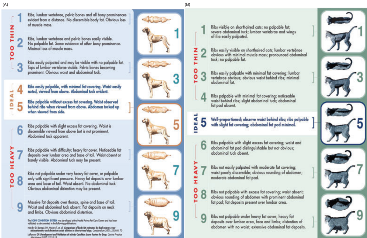
Figure 2. Body Condition Scoring (BCS) System for dogs (A) 13 and cats (B) 14